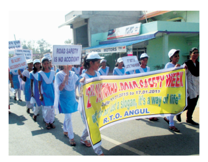
Students studying in the areas affected by TSIL Project, participating in Road Safety Week, an initiative under social change and awareness programme at Angul