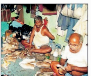
a man makes as little as Rs 20 per shoe after slogging at it the whole day.

Popularly called the Muchi Colony, these people are traditional cobblers from Bihar who have lived here for four generations. They buy tanned leather from middlemen on credit and make shoes according to specifications. This might sound innocuous but the real story is something different, they are never able to re-pay their credit, which keeps mounting and the middlemen do their best to exploit them. There is a close link between the suppliers of raw materials and the buyers of finished products. This also helps to dictate the low price at which the cobblers are forced to sell their shoes. On an average,