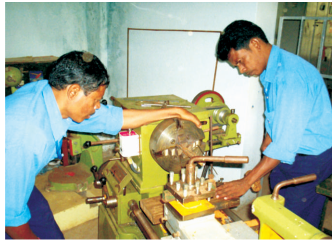
Youths engaged in the Centring of Job on the lathe machine during the Skill Development Training under Personality & Workmanship Development Programme