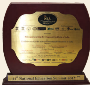
Excellent Institute for Entrepreneurship Development in India Award (2017)