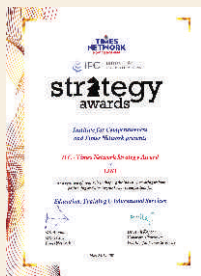
IFC - Times Network Strategy Award (2017)