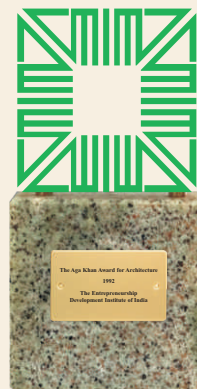
The Aga Khan Award for Architecture (1992)