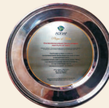
Association of Development Financing Institutions in Asia and the Pacific (ADFIAP) Development Award for Human Capital Development (2012) and for Local Economic Development (2014)