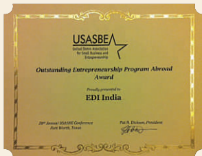
United States Association For Small Business And Entrepreneurship (USASBE) Outstanding Entrepreneurship Program Abroad (2014)