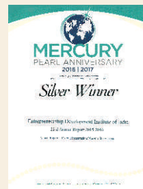
Mercury Award (2017)