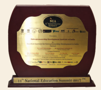
Excellent Institute for Entrepreneurship Development in India Award (2017)