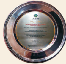
Association of Development Financing Institutions in Asia and the Pacific (ADFIAP) Development Award for Human Capital Development (2012) and for Local Economic Development (2014)