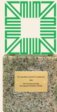
The Aga Khan Award for Architecture (1992)