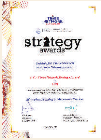
IFC - Times Network Strategy Award (2017)