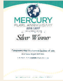
Mercury Award (2017)