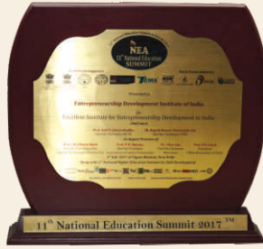
Excellent Institute for Entrepreneurship Development in India Award (2017)