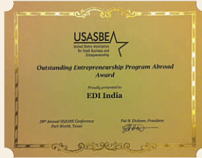
United States Association For Small Business And Entrepreneurship (USASBE) Outstanding Entrepreneurship Program Abroad (2014)