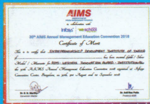
AIMS - WESCHOOL Innovation Award (2018)