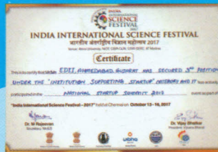
AICTE Award for Supporting Start-ups (2017)