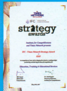
IFC - Times Network Strategy Award (2017)