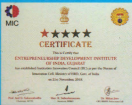
Institution Innovation Council (MHRD, Govt. of India)