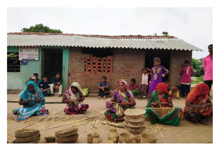
Women Entrepreneurs are making Bamboo Products

viable. After SVEP intervention the business had restarted in July, 2017 with only decorative Pooja thali.