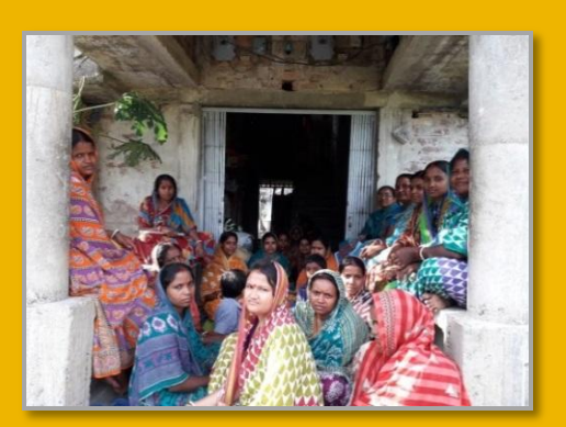
UPA Sangha meeting, W.B.