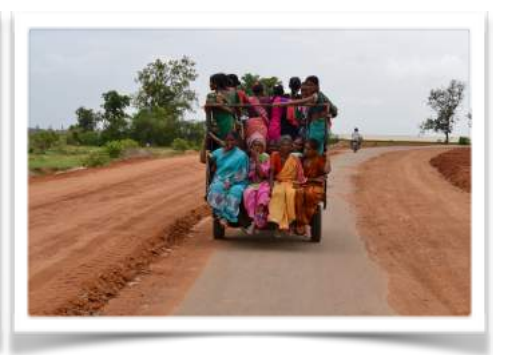
Off the beaten track Bijinapally, Telangana