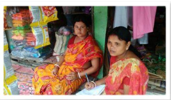
Entrepreneur handholding Dinhata-1, West Bengal