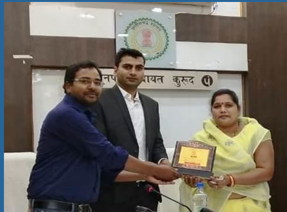
EDII Mentors Felicitated