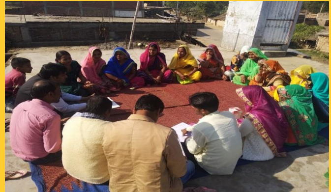
Focus Group Discussion (FGD) - Dhanapur, Uttar Pradesh