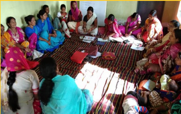
General Awareness Training Programme & Orientation on SVEP – Thetaitangar, Jharkhand