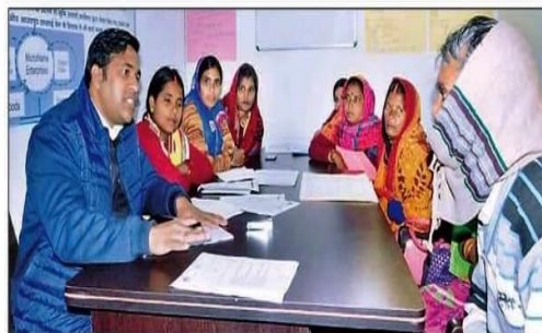
आराजी लाइन में महिलाओं को लोन की जानकारी देते अधिकारी।

आजीविका मिशन के तहत स्वयं सहायता समूह से जुड़ी 47 महिलाओं ने लघु उद्योग लगाने के लिए आवेदन किया था। लोन आवेदनों की बैठक में आवेदनों पर विचार