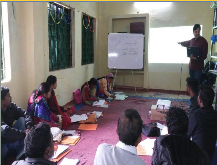
CRP-EP Refresher training - Kolibera, Jharkhand