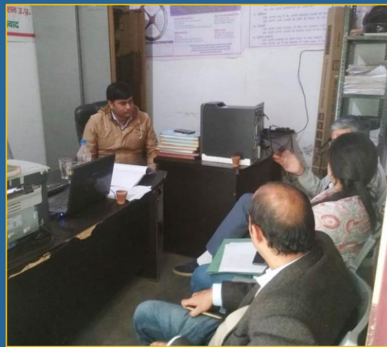
World Bank team at EDII-SVEP Tappal Block, UP