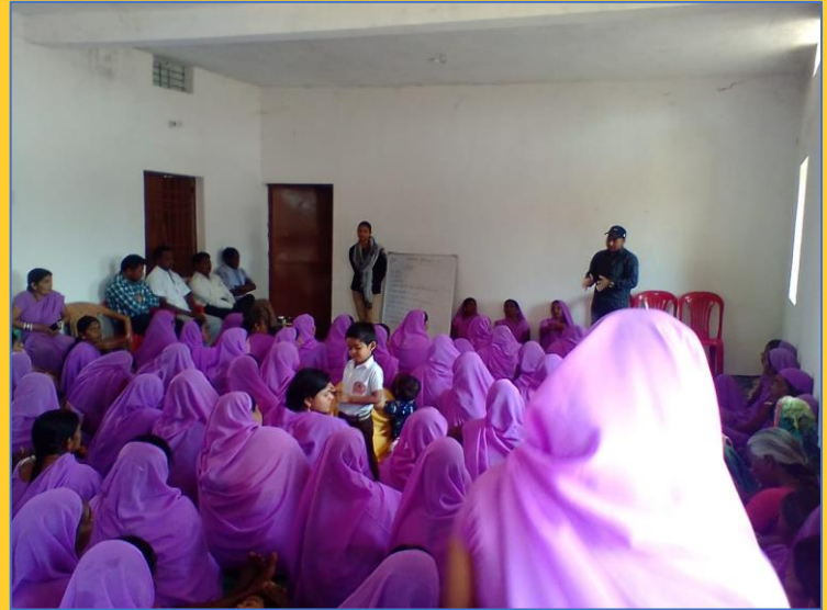
SHG Monthly meeting - Chhatisgarh