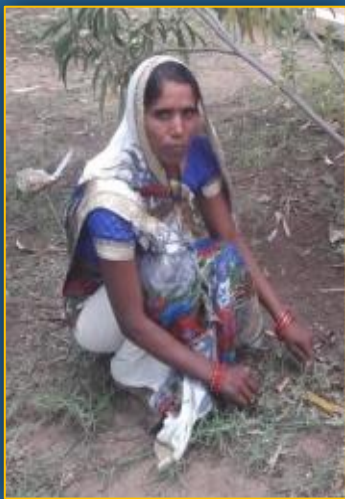
Success Story: BRC Member