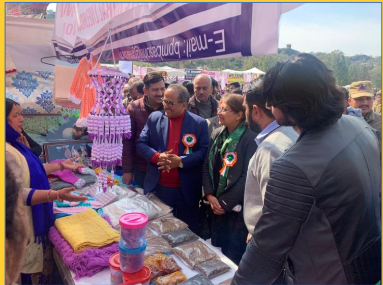
Hon. Speaker, J&K at SVEP Basoli entrepreneurs Stall , Kisan Mela, Jammu