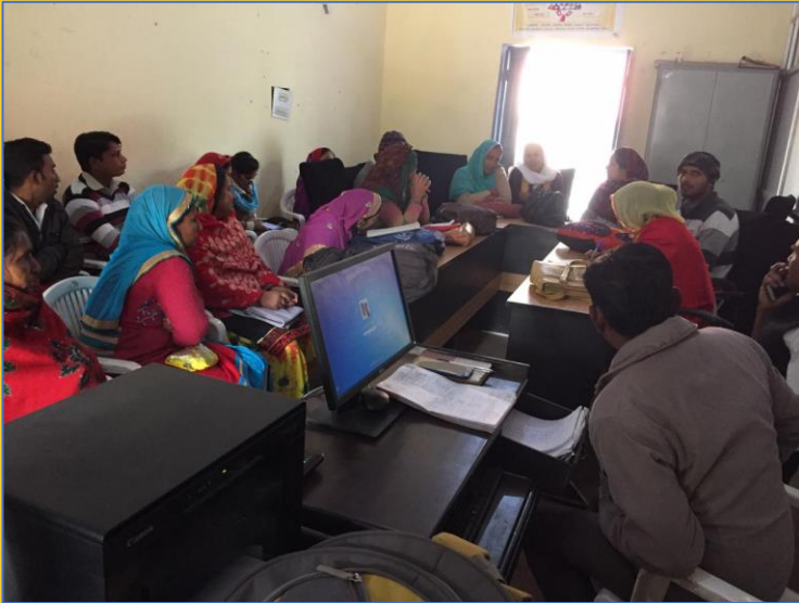
Review Meeting - BRC Bawani Khera, Haryana